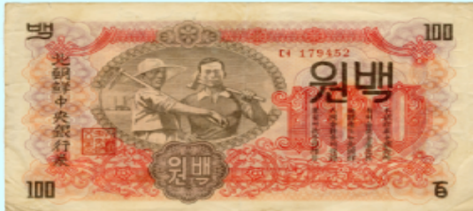
Lot 3: 1947 100 Won, Pick-11a, North Korea, VF