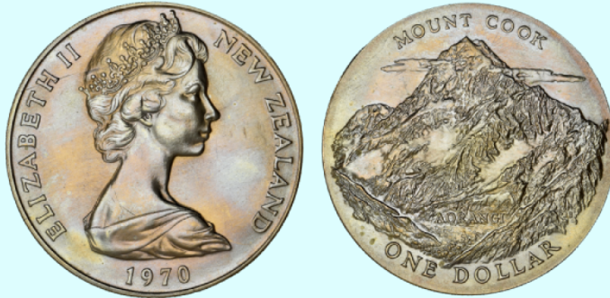
Lot 2: 1970 One Dollar, KM-42, New Zealand, Unc.