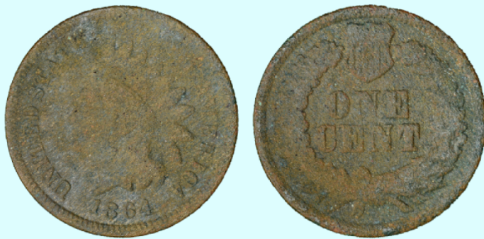
Lot 1: 1864 "L" on Ribbon, One Cent, Heavy Corrosion